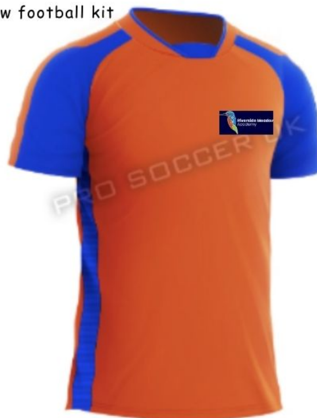
New football kit

We look forward to hosting Gretton school at home in the near future.